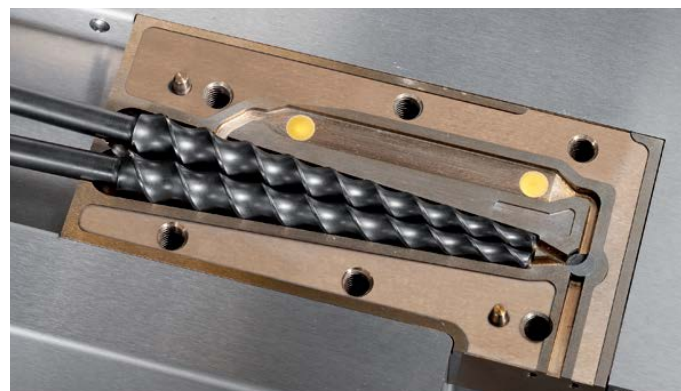
Lower barrel with closed bypass valve and pressure transducers